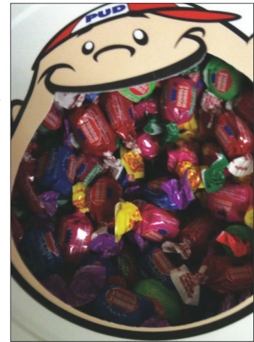
Great gum selection!