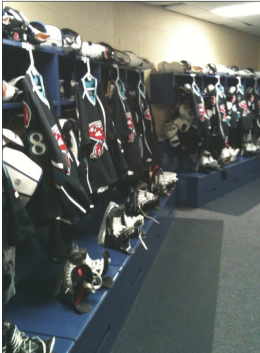
Visitor's locker in the DeSoto Civic Center

During the first period, our forwards and centers were going in and out of "my" door. For the second period, that changed as the defensive corps would be using the